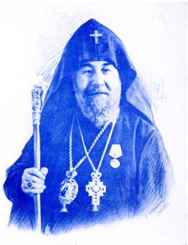
His Holiness Kevork VI Catholicos of All Armenians