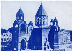
Cathedral at St. Echmiadzin Seat of the Patriarch-Catholicos of all Armenians since 301 A.D.