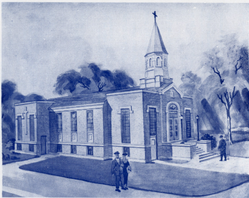
Our Church of Tomorrow